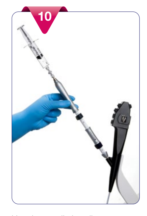
Use the needle handle to move the needle back and forth within the biopsy site. Before the puncture ends, close the stopcock, pull the needle handle back as far as it will go and fix it in the safety position. Then remove the SonoTip® TopGain needle.