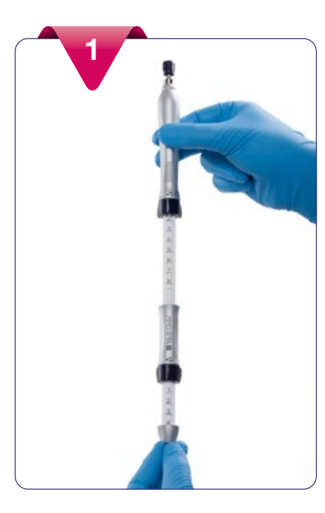
Before introducing the SonoTip TopGain® needle please check the instrument for intactness and safe functioning. Make sure that both Twist-Lock settings are locked in the safety position.