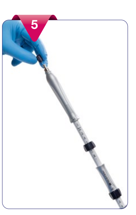
Round tip stylet: As soon as the needle has been moved out of the sheath, loosen the stylet from the proximal Luer-Lock of the needle handle and pull it back about 5 mm.