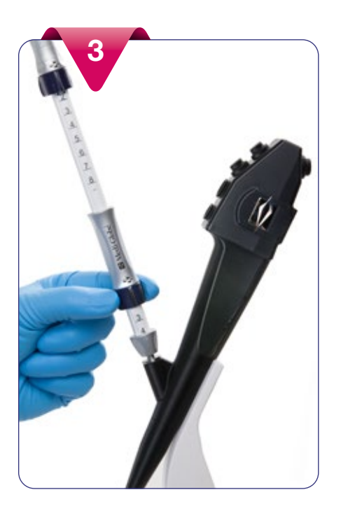
Adjust the sheath length. To do this, unlock the lower Twist-Lock and slide the handle down until the desired position for the tip of the sheath is reached. Then fix the setting.