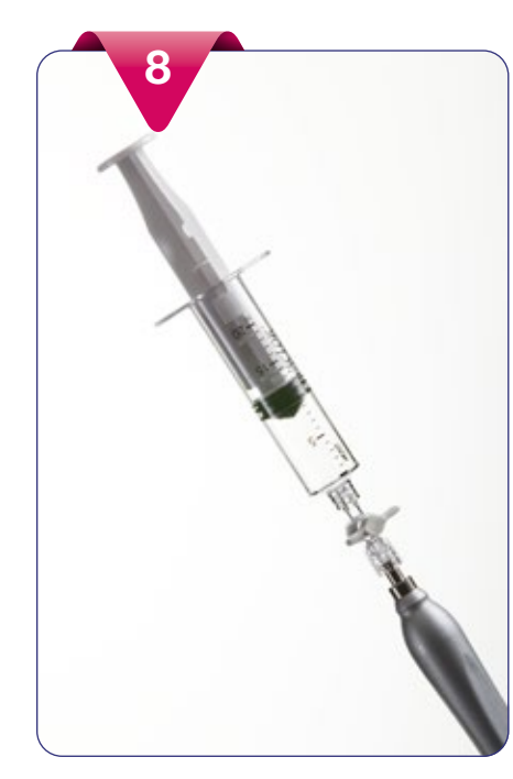
Connect the prepared syringe (with negative pressure) with the Luer-Lock to the proximal end of the biopsy needle ...