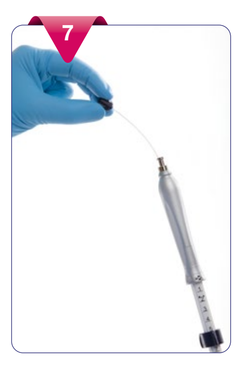
When the needle has completely penetrated the target structure, close the stylet again. Then, remove the stylet completely from the biopsy needle.