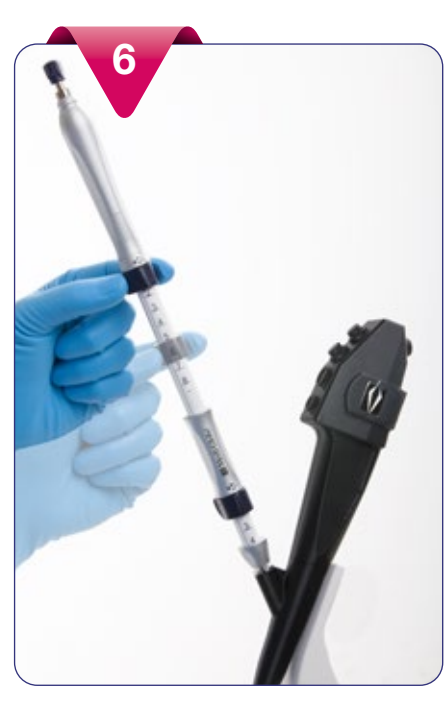
Carefully insert the needle into the target tissue. The maximum needle projection can be preset with the upper Twist-Lock for puncture depth adjustment.