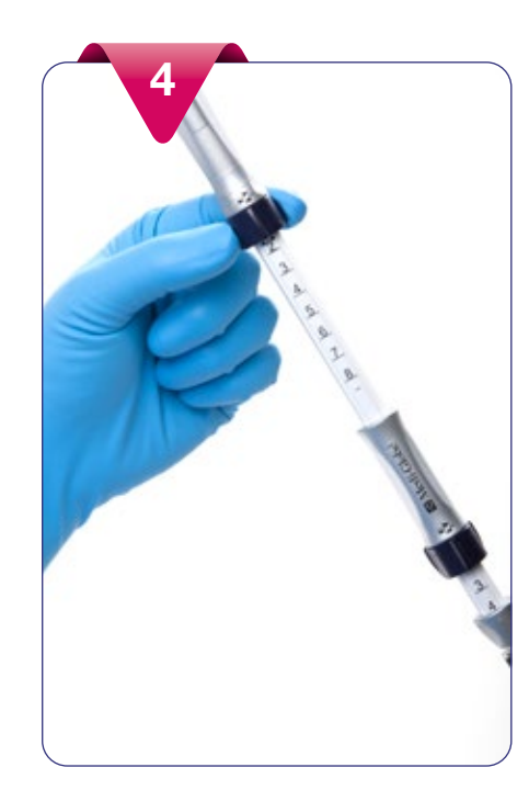
Unlock the Twist-Lock for puncture depth adjustment and slowly move the needle handle to guide the needle out of the plastic tube.