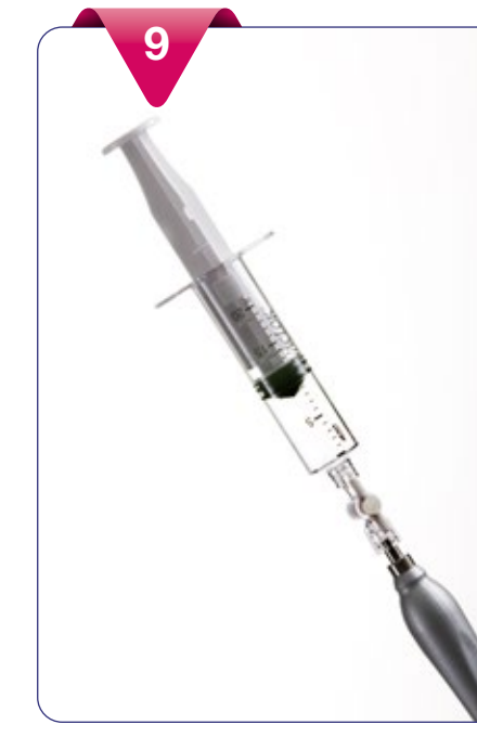
... and turn the stopcock to its "open" position. The desired tissue sample is sucked into the needle by the vacuum inside the syringe.