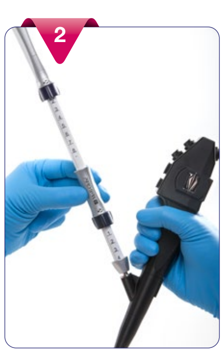
Slowly insert the instrument into the working channel and lock it to the working channel with the Luer-Lock Connector.