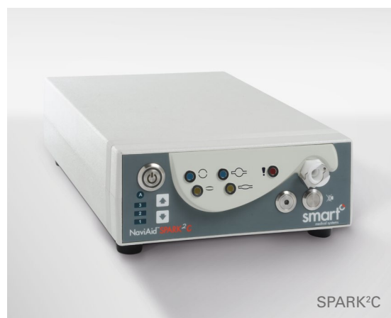
SPARK 2 C