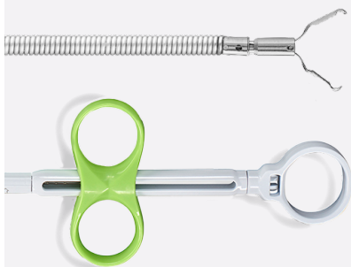
RELIANCE™ Hemoclip Uncoated 16mm

MR conditional under static magnetic field of 1.5T/3.0T, maximum spatial field gradient of 2,000 gauss/cm and maximum MR system reported whole body averaged SAR of 2 W/kg. Reference instructions for Use for full details.